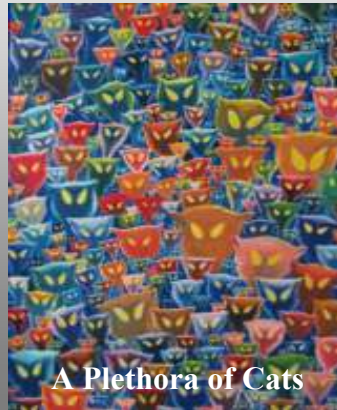
A Plethora of Cats