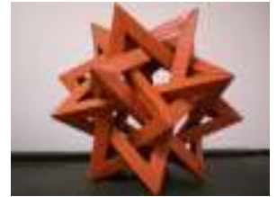
5-intersecting tetrahedra http://kahuna.merrimack.edu/~thull/fit.html