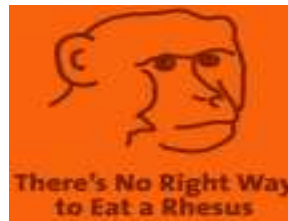
Witty t-shirts http://www.mentalfloss.com/