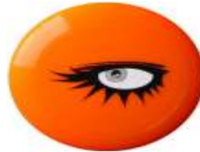
Clockwork Orange frisbee http://www.discshoppe.com/