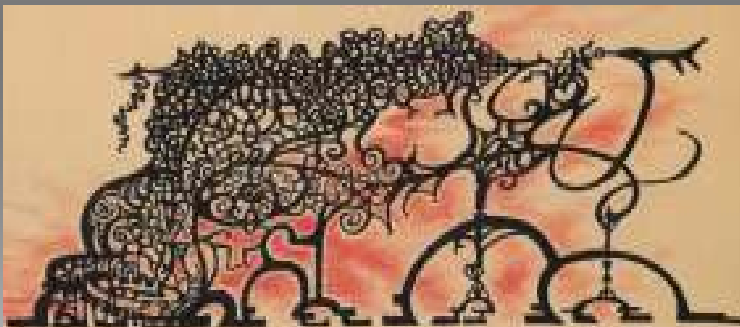
Impractical Marshmallow-Toasting Device