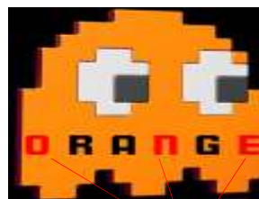
There's only one non-"inky" PacMan ghost: Clyde!