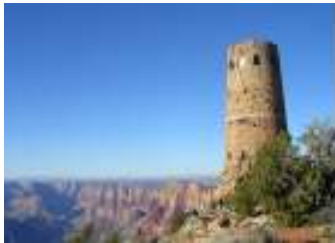
Atalaya(s) – a watchtower