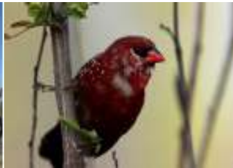
Avadavat or amadavat – a songbird